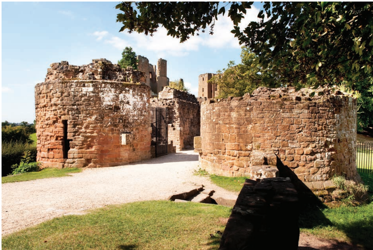
A recent photograph of the remains of Mortimer's Tower, the main gatehouse to Kenilworth Castle, which was built in King John's reign.